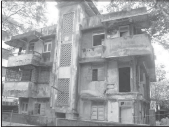
1 BUILDING BEFORE DEMOLITION