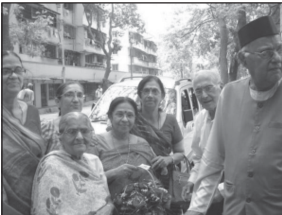
3 BHOOMI POOJAN