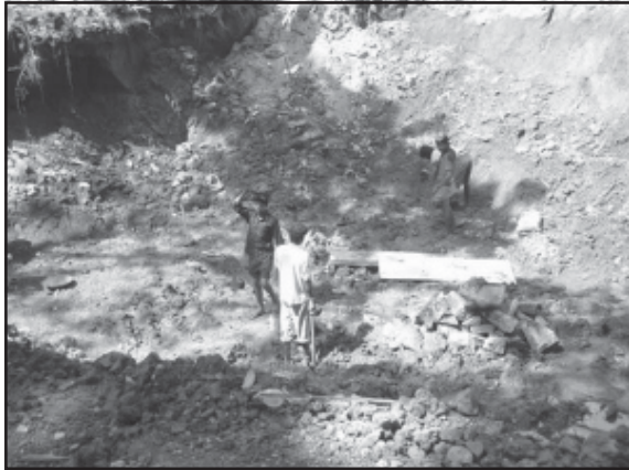
2 BUILDING GROUND AFTER DEMOLITION